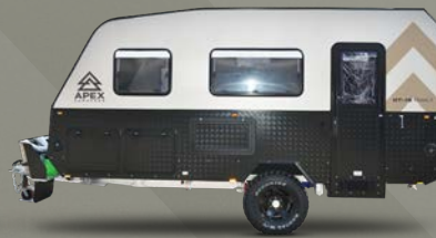
APEX HT-16 FAMILY