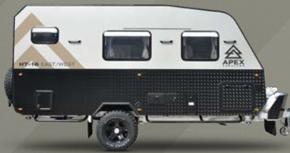
APEX HT-16 EAST/WEST