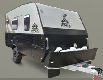
APEX HT-16 ISLAND