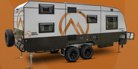
SIGHT SEEKER ASPIRING HT-21