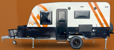
SIGHT SEEKER AORAKI HT-16

The Sight Seeker series offers the interior look and feel of a luxury caravan, while underneath is the ground clearance, independent suspension, and galvanised chassis to help you traverse New Zealand with confidence. Modern heating, lighting and appliances mean going off-grid and off-road in comfort and style.