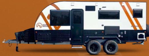
SIGHT SEEKER RUAPEHU HT-19